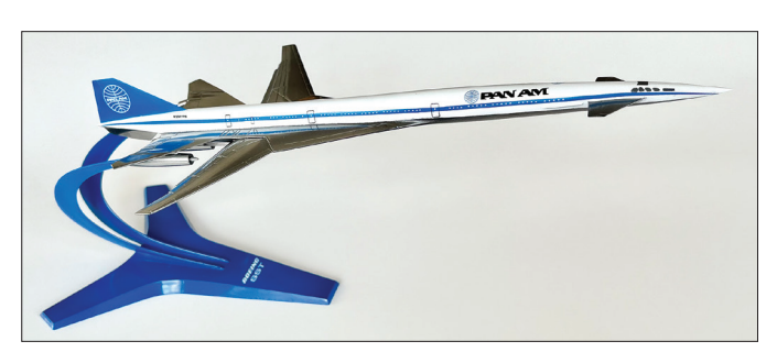
Atlantis' Boeing SST is resplendent in bonus Pan Am markings included with the kit.

Atlantis Models doesn't simply duplicate a previous release of a kit. In this case, they added all-new decals - two schemes to choose from! Boeing's famous 1960s yellow prototype décor is included (we actually provided input regarding historically accurate possibilities, and this was the one that appealed to Atlantis). The "surprise" scheme is legendary Pan American Airlines, which would