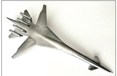
We used Alclad II metal finish over Testors gloss-black to achieve a shiny metallic finish on this model. Learn more about this and many other Atlantis kits at our website, 2Modeler.com.

Thanks to the low price, your customers will be motivated to buy multiple kits to build these fantastic flight-of-fancy