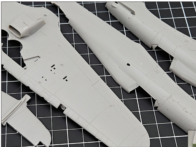
A little bit of clean up work results in easy-to-finish parts.