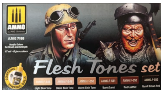
A wide range of flesh tones to suit any build.

coats and a smooth finish. Use the Transparator with darker colors to create shadows on the face for the illusion of depth.