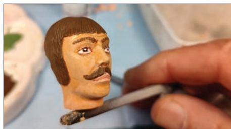
Facial details stretch any modeler's skills.

MIG AMMO has good videos for using the Flesh Tones Set on their website. Use light coats and blend the shades for more realism. Everyone's flesh has different shades. The Transparator excels at turning the paints into transparent colors to make blending easier. This is also more forgiving of too much or not enough paint in a spot. The set worked well for both skin and hair.