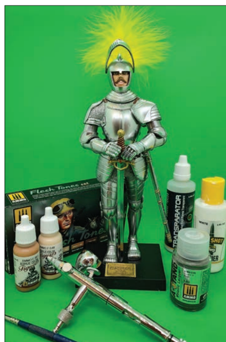
There's room for the Knight on your shelves.

The work pays off in the form of an eye-catching display piece, standing 9 1/2 inches tall. The Silver Knight is one of several reissues of classic figure kits. The figures require specific skill sets, like realistically painting flesh, eyes and hair. Several of the completed figures displayed together would make an attractive model shelf. HM