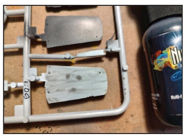
Heavy wash on a smooth surface.