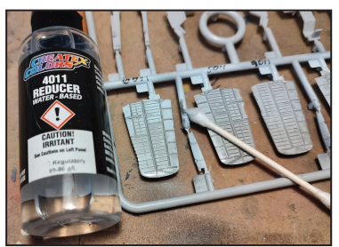
Use a swab to erase mistakes.