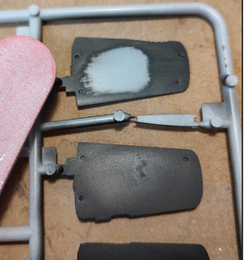
Gamers won't have to worry about the paint coming off their figures.