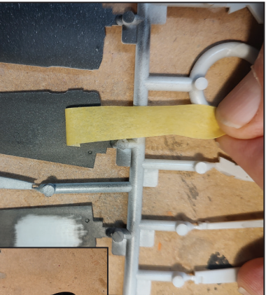
(Top) Tape doesn't pull off dried paint. (Left) The finish is smooth on textured surfaces.