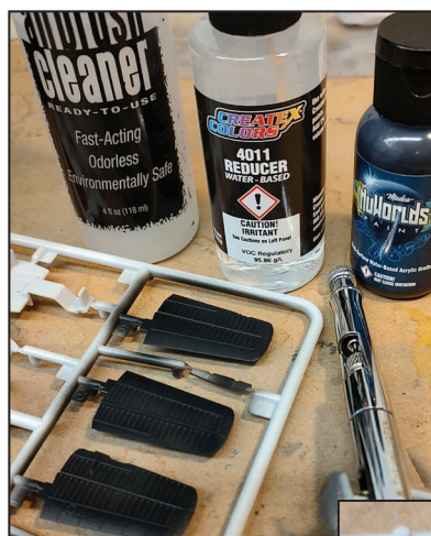
The base coat looks great on a sprue out of the box.

Users can skip the primer step, as all the paints are direct-tomedia formulas. Every color is ready for hand brushing or airbrush application, so there's no need for fussy reducers or thinners. Each color has multiple pigments, so it covers with fewer coats. Thinning the color for washes is easy, giving users endless possibilities for