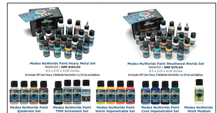
Iwata-Medea NuWorlds Paints are available in sets and themes for gamers and modelers.

on the second wing down. NuWorlds would not rub off. Next came wet sanding. No trouble!