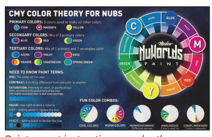
Painters get instruction on color theory.

Check with your model paint distributors on the availability of NuWorlds Paints. HM