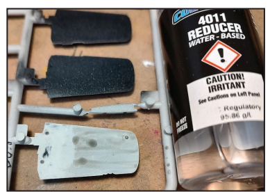
Excellent adhesion and durability.

medium adds versatility to the line. Since the user will be mixing their own washes, infinite shades are possible! A moistened cotton swab can be used to lift any excess wash, which makes it very forgiving.