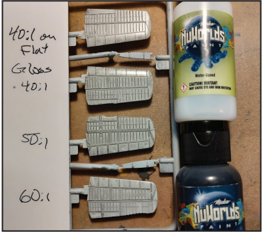
Subtle shading made easy.