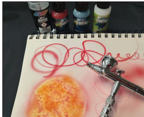
Like any other art, airbrushing takes practice and knowledge to excel.

One of those available was the Eclipse Takumi Side Feed Airbrush. More responsive with a shorter front end and easy clean gravity feed cups make the Takumi an excellent workhorse.